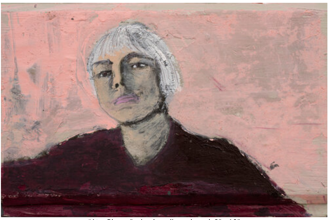
"At a Glance" mixed media on board, 8" x 10"