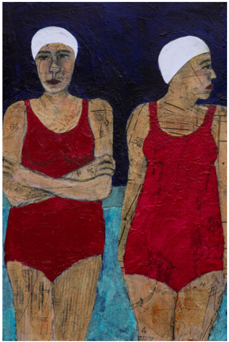
"Stalemate" mixed media on board" 36" x 24"

My work is about moments, familiar bits and pieces that combine in different ways and make up a life.