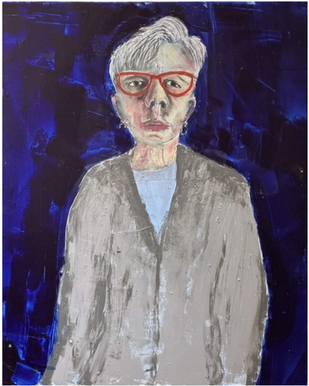
"Leave It" mixed media on board, 29" x 24

It's a bridge to the common ground I share with others and a direct connection to myself. Perhaps this is what all art is.