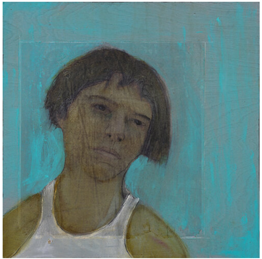
"Looks Just Like" mixed media on board,12" x 12"