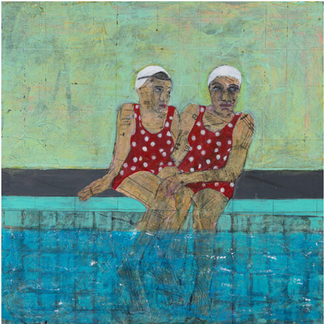
"Hard to Believe" mixed media on board, 36" x 36"