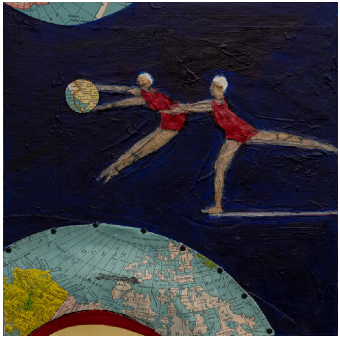
"Take Flight" mixed media on board, 10" x 10"

I don't know when I start a piece which moment I will zero in on.